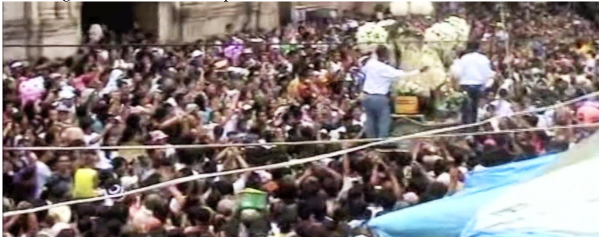
Figure 3: The participants in the Turumba ng Birhen while performing the Sayaw sa Turumba —jumping, waving their hands in the air, clapping, and tapping each other's shoulders, and singing the Awit sa Turumba to the accompaniment of a musical band, and at the end of each stanza of the song, they shout " Sa Birhen! " (Photo by the author, 2010).

The most important ritual or traditional custom during the Lupi is the Turumba , or the participation in the procession of the Blessed Virgin of Turumba after the Holy Mass. Groups of people join the procession during each Lupi . It is a joyful sight to see the groups of youth or even of the elderly, whether they are from Pakil or devotees from other places, due to the lively, active, and vibrant dancing, singing, jumping, and clapping, as if it were a performance by people who have lost their senses. Thus, it is unsurprising that onlookers are drawn to join and participate, despite the crowded and energetic movement of the procession.