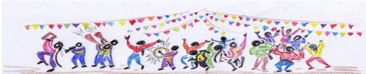
Illustration: Expressive form of emotion and devotion manifested in a fiesta-like or festive procession – the Turumba sa Birhen (drawing by the researcher, 2013).

Beyond the physical color and glitter of the fiesta-like celebration of the procession, the Turumba sa Birhen can also be examined in terms of the type and form of feeling or emotion displayed in its performance. In the event of the procession, one can witness manifestations of the "colorful and glittering" expressive form of the deep and intense feelings and emotions of the participants, which only proves their fervent and steadfast faith and devotion.